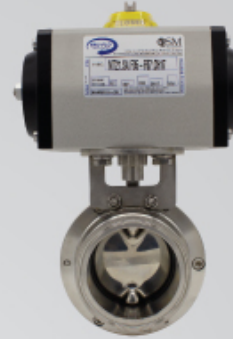
BFY with MT Actuator