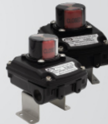
QMS & QPS Limit Switch