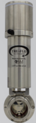
K-1111 Canister Actuator