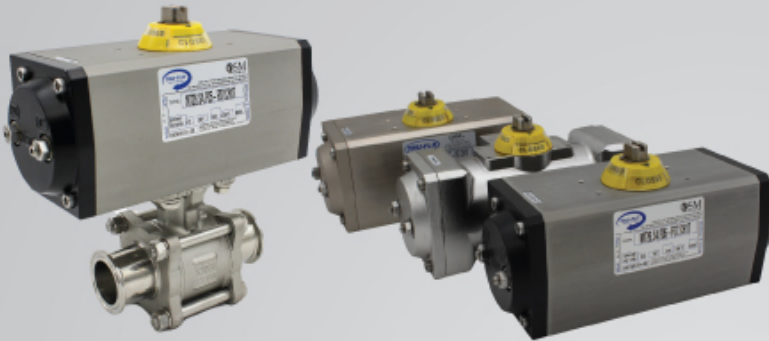
MT Series: Aluminum, Nickel-Infused or Stainless Steel